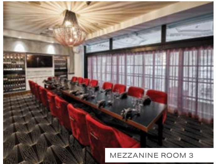
MEZZANINE ROOM 3