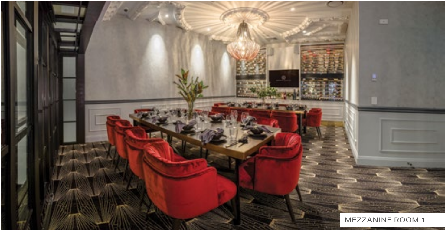
MEZZANINE ROOM 1

The decadence of the mezzanine level pays homage to the heritage listed elements of the building and are sure to impress. You can utilise all three rooms as one larger space or they can be used individually.